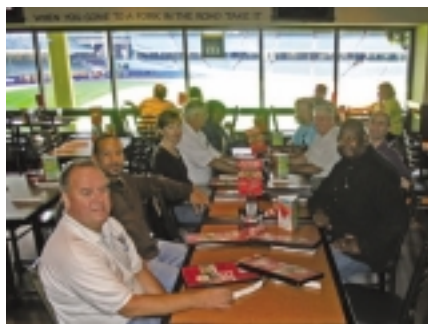
Hunger Task Force volunteers enjoy a fun lunch at Miller Park after their work is done.