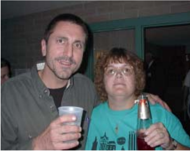
On your mark, get set... Chug!