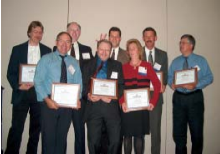
Presidential Citation Recipients